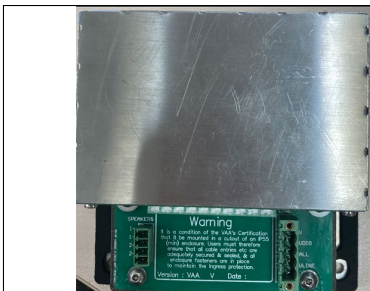
Figure 1 – AUSEx/ANZEx compliant battery Can be used with all VAAs Fascias

The manufacture of batteries built to be compliant with the AUSEx scheme continued for a period of time to support the repair of AUSEx Fascia's that remained in service. These batteries do not have a warning label as shown in Figure 1.