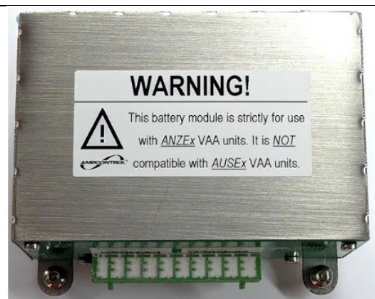
Figure 2 – ANZEx compliant battery Shall only be used with ANZEx VAA Fascias