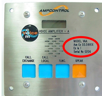
Figure 3 – Location of Certification details on VAA

AUSEx VAA Fascia's can be identified through the markings on the front of the VAA as indicated in figure 3.